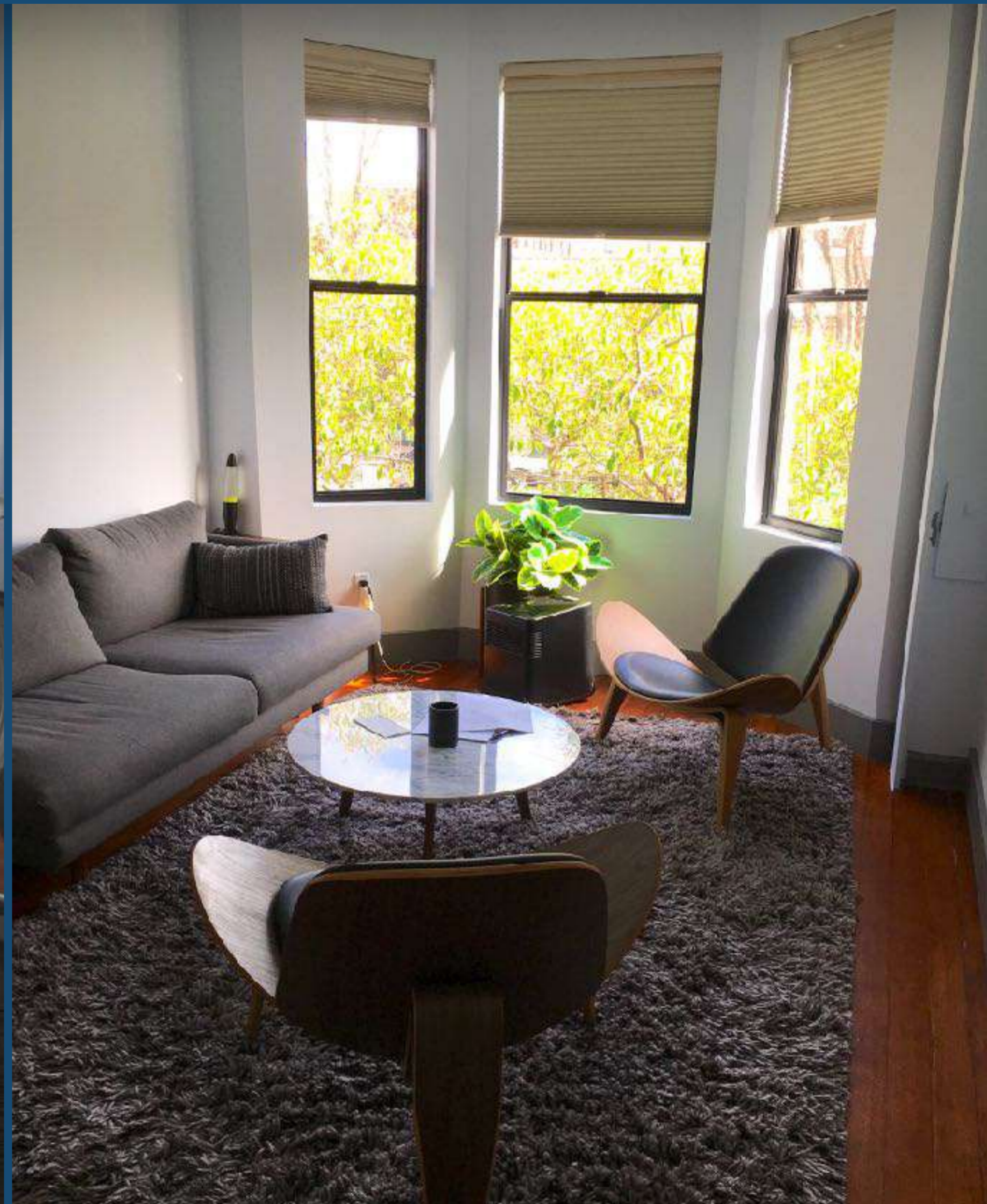
3RD FLOOR SPACE

AVAILABLE Now SIZE Approximately 1,500 SF